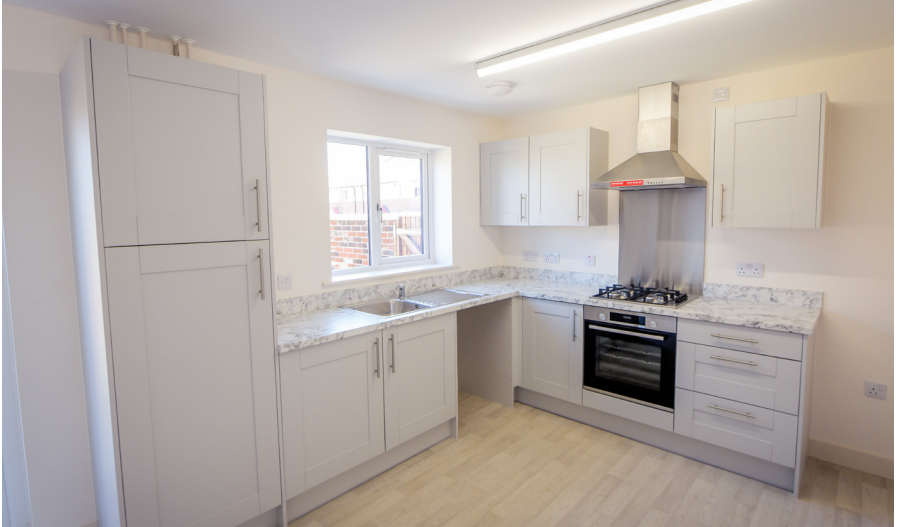
Smooth Grey kitchen with Marmor Bianco worktop

This image is for illustrative purposes only and is not a photograph representative of what has been installed at The Saxon Park, Branston.