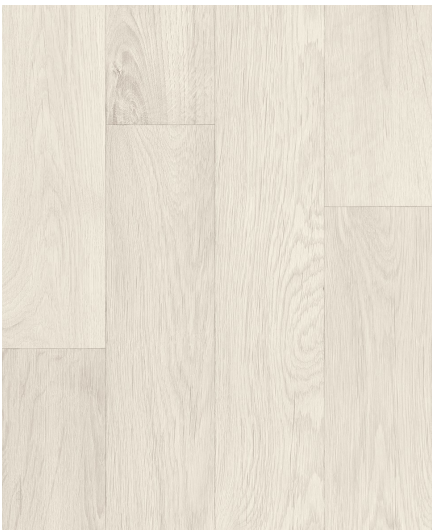
Camargue 520 Vinyl Flooring