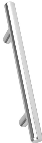
Chrome bar handle